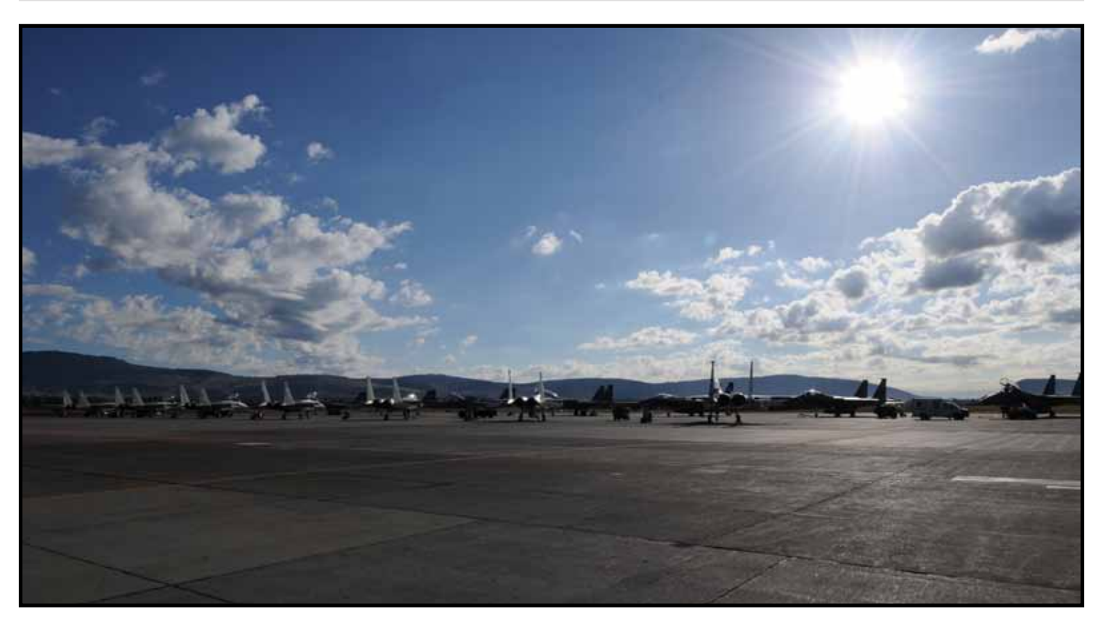
173rd Fighter Wing flightline on a June 2013 morning.

The views expressed, stated or implied in this publication are not necessarily the views of the Department of Defense, the U.S. Air Force or the Oregon Air National Guard. Circulation: 1,000. All photographs are U.S. Air Force or Air National Guard photographs unless otherwise indicated. Story submissions, letters to the editor or other comments are encouraged and may be directed to: